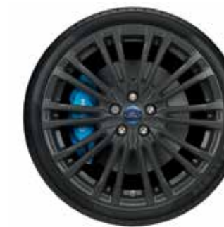
Optional Alloy wheels 19" 20-spoke unique RS design alloy shown with optional painted wheels and optional blue brake callipers.