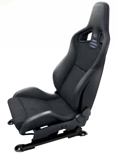
Strap yourself into the optional, lighter RECARO® shell seats for a more connected feel to the all-new FOCUS RS .