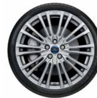
Standard Alloy wheels 19" 20-spoke unique RS design alloy.

The high-performing character of the RS is reflected throughout the car. A new flat-bottomed, leather-trimmed steering wheel enhances your performance and driving experience, while the new signature RS RECARO® seats make up the centrepiece of the RS cockpit.